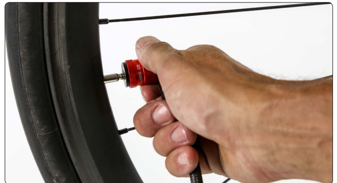
Pull sleeve back to instantly release the ABS2.