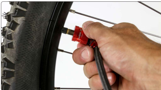
Slide sleeve forward and thread onto Shrader valve.