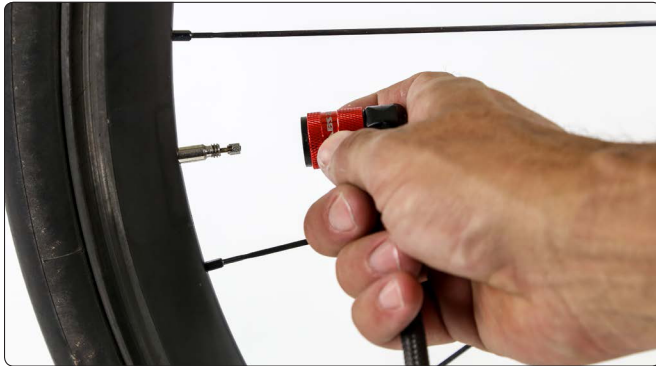
Open Presta valve and pull sleeve back on ABS2 chuck.