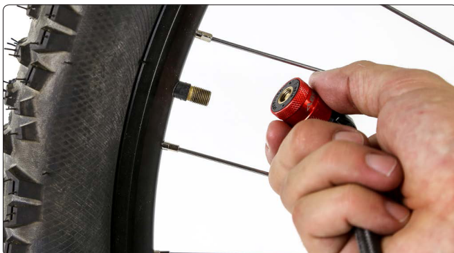
Unthread to remove ABS2.