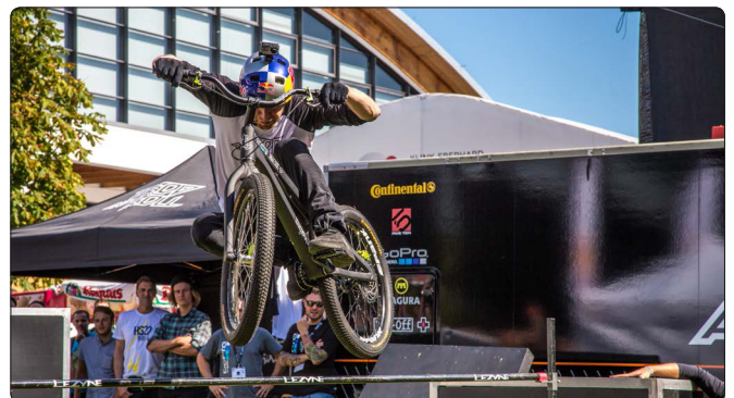
Go to www.lezyne.com for more information.