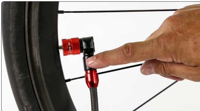
Inflate to desired pressure and use the bleed valve to adjust pressure.