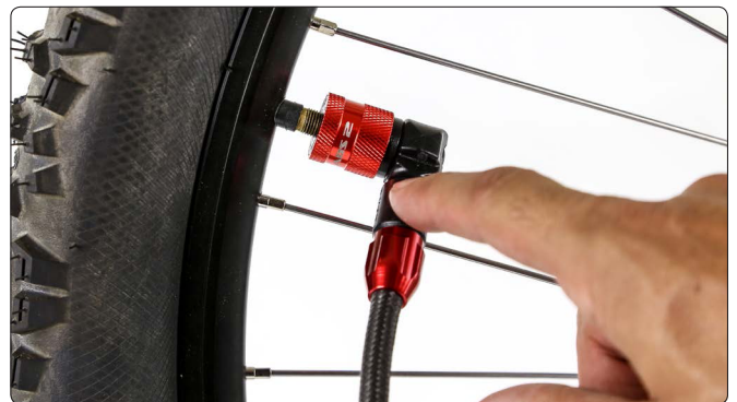
Inflate to desired pressure and use the bleed valve to adjust pressure.